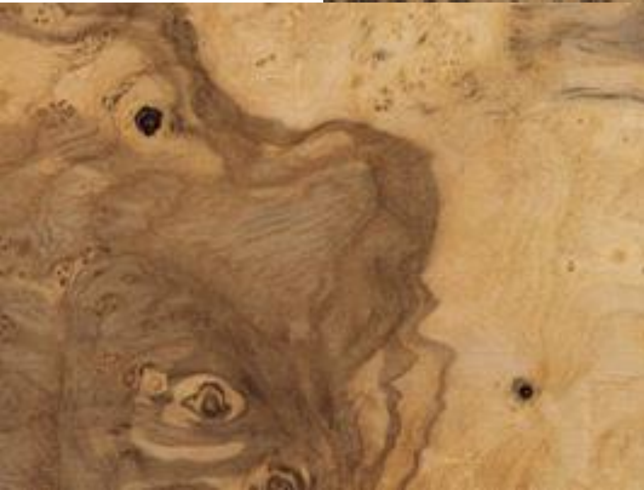
EXOTIC WOODS ASH – OLIVE BURL