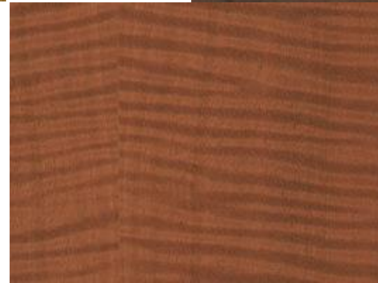
MAKORE QUATERED FIGURED